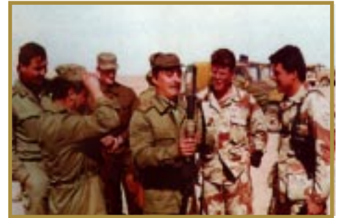
Czech and American soldiers compare equipment in the desert.

neither given inoculations for Anthrax and Botulinum Toxin, nor did they use pyridostigmine bromide (PB) as protection against biological warfare agent attack. The most recent Czech report, released in August, will be posted on DoD's Internet site, GulfLINK, once it is translated.